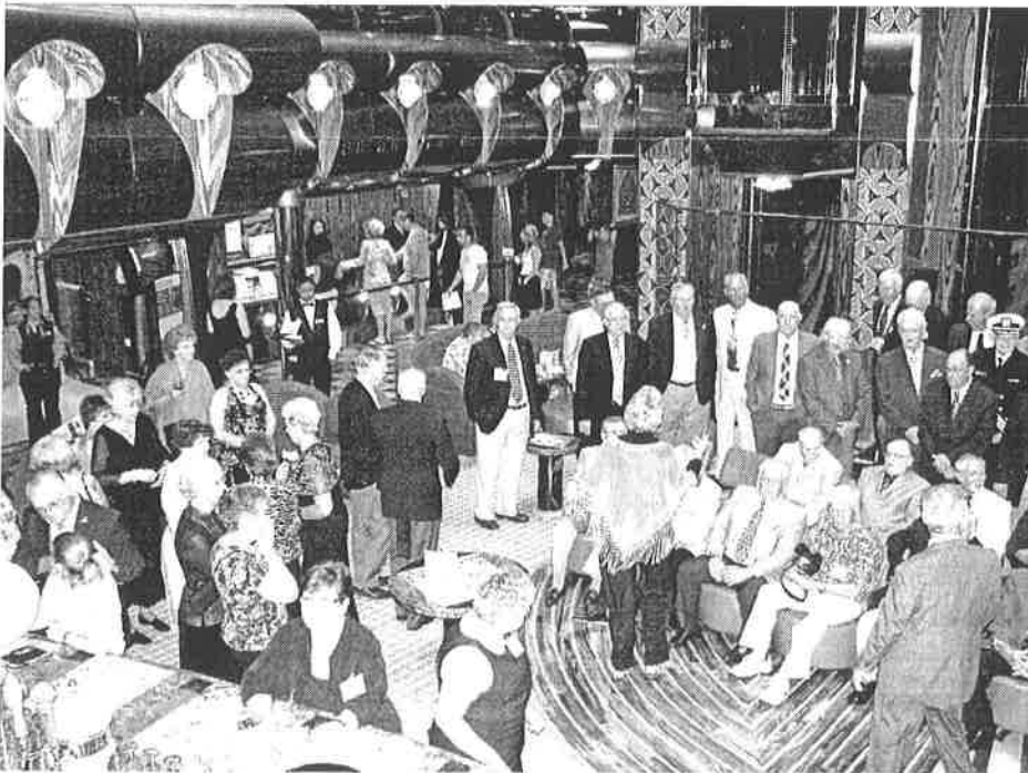
Yagrmen with spouses and guests in ship's Atrium.

It was reported that a Navy recruiter would be onboard the ship in an effort to recruit as many former picket ship crewmen as possible, but the scuttlebutt is that he did not make this trip because he did not want to spend such a long period of time (6 days) away from home.