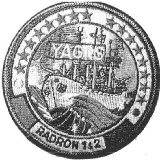
3 inch YAGR'S embroidered logo patch in color.

Thanks to Charles "Chuck" Coons (AGR-13) we now have the YAGR's logo patch available. If you would like to order one, the cost is $5.00 each, postage included. We have a limited quantity of these patches so if you want one, do not wait too long to order yours. Once they are gone, they are gone.