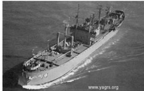
USS INTERPRETER AGR-14