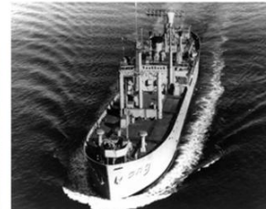
USS INVESTIGATOR AGR-9