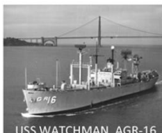
USS WATCHMAN AGR-16