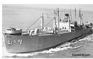
USS GUARDIAN AGR-1 Erv Thomure