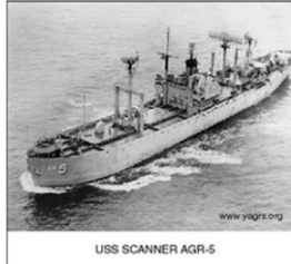
USS SCANNER AGR-5