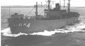
USS SEARCHER AGR-4