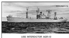
USS INTERDICTOR AGR-13