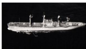
USS OUTPOST AGR-10