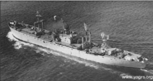
USS PROTECTOR AGR-11