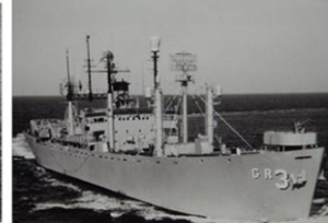
USS SKYWATCHER AGR-3