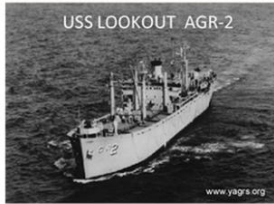
USS LOOKOUT AGR-2