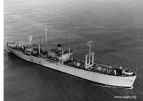
USS PICKET AGR-7