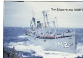
Tom Ellsworth and YAGR'S USS Vigil (AGR-12) Coming along side the USS Protector (AGR-11)