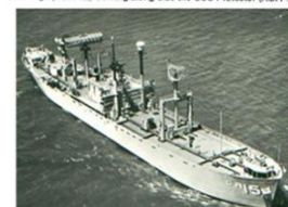
USS TRACER AGR-15